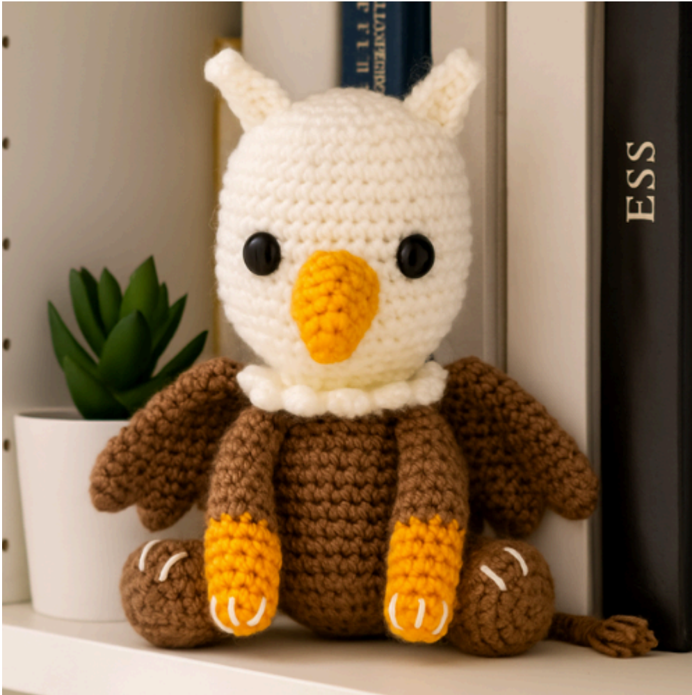
My little griffin